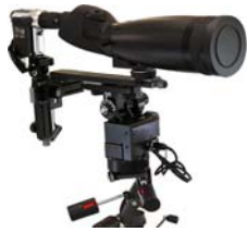
A-1 spotter (P): AEGIS auto control spotting system