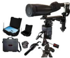
A-1 spotter (S): AEGIS spotting communication system

A-1 spotter series Sales Enquiries Support Center +91-11-26167353