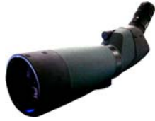
A-1 spotter (B): AEGIS spotting scope